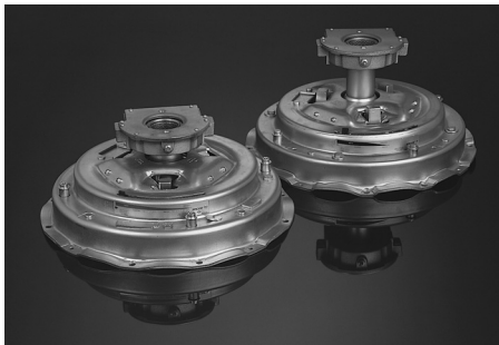
Solo® Adjustment-Free Single and Two Plate Clutches

Reliability and long life are certainly two reasons why Fuller Clutches are the number one selling clutches in North America. Eaton offers a complete line of push and pull type medium-duty clutches with application coverage from 100 to 330 horsepower engines and up to 1150 ft. lb. of torque. This bulletin provides application and adjustment guidelines to assure you the reliability and long life you've come to expect from Fuller Clutches.