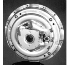
Stamped Angle Spring® (Pull Type)